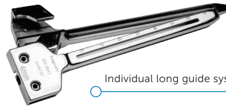
Individual long guide system