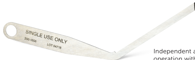
Independent antegrade knife operation with view port