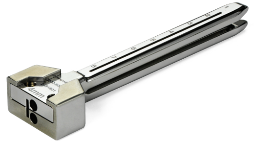
Uniportal dual scope guide system