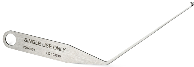
Independent retrograde knife operation