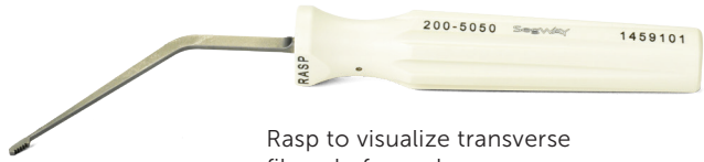
Rasp to visualize transverse fibers before release