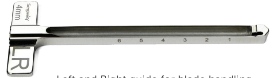
Left and Right guide for blade handling preference and measurement