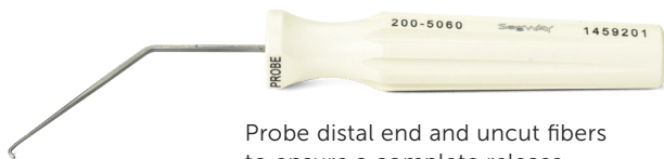
Probe distal end and uncut fibers to ensure a complete release