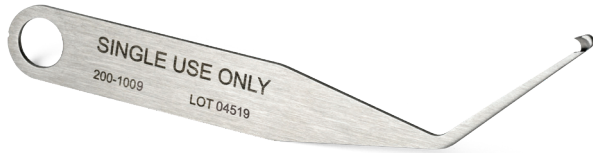
Independent retrograde knife operation