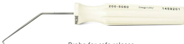
Probe for safe release