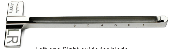
Left and Right guide for blade handling preference