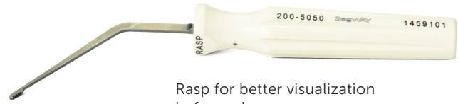
Rasp for better visualization before release