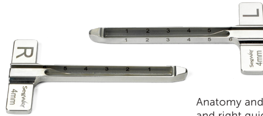
Anatomy and patient specific left and right guide system