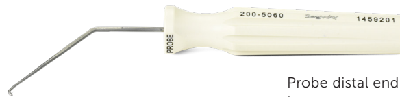
Probe distal end and uncut fibers to ensure a complete release