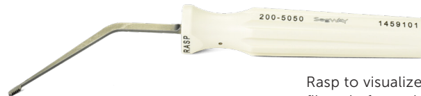
Rasp to visualize transverse fibers before release