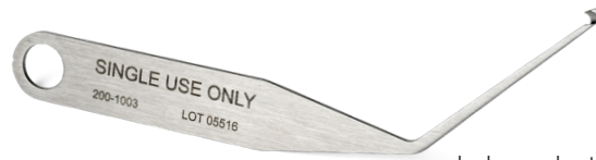
Independent retrograde knife operation