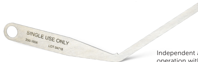
Independent antegrade knife operation with view port