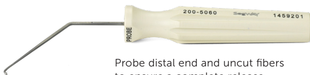
Probe distal end and uncut fibers to ensure a complete release