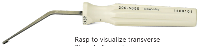
Rasp to visualize transverse fibers before release