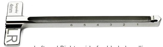
Left and Right guide for blade handling preference and measurement