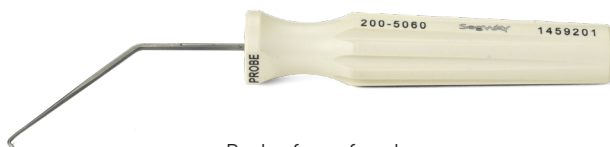
Probe for safe release