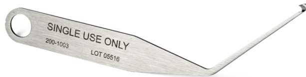
Independent retrograde knife operation