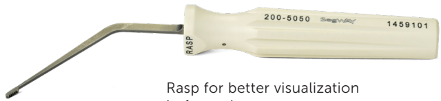
Rasp for better visualization before release