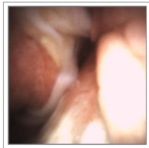
Figure 2. Intact anterior cruciate ligament visualized ascending into the femoral notch using in-office arthroscopy (mi-eye 2™).

as the previous examination—antalgic gait, minimal tenderness along medial joint line, medial pain in deep flexion, and no pain when in varus or valgus. We discussed the patient's injury history and it was our recommendation to perform an in-office diagnostic arthroscopy (mi-eye 2™) due to the continued pain and discomfort with a negative MRI. The patient agreed with this recommendation and was scheduled to return for mi-eye 2 procedure in approximately 2 weeks with the goal to visualize pathology and develop a treatment plan.