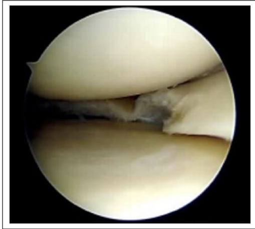
Figure 5. Image of the meniscus after debridement to a stable rim.

Some studies have questioned the ability of MRI to accurately detect and characterize the size of articular cartilage defects. A study comparing MRI reports from musculoskeletal radiologists to arthroscopic findings in 82 patients found that MRI reports missed 55% of all chondral lesions. 10 Gomoll et al. investigated the disparity between intra-operative measurements of chondral defect size and preoperative MRI size estimates in 37 patients who underwent open cartilage repair. They found that 85% of all defects were larger than predicted on MRI by an average of 65%, and only 8% of defects were accurately predicted (within 10% of final size). 11 In a similar study of 77 patients, Campbell et al. 12 found that 74% of defects were larger than MRI estimates, which underestimated the size by 70% on average. These findings have important implications as treatment algorithms in cartilage repair are based primarily on defect size, and reliance on preoperative MRI scans alone has the potential to compromise treatment decisions.