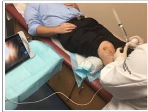
Figure 1. In-office image of the mi-eye 2™ arthroscope being used to evaluate the knee.

The patient returned to our office for 6-week follow-up visit. Approximately 2 weeks prior, he had experienced an injury to his right knee while teaching a kickboxing class, which had caused severe pain. The pain was severe enough in nature to cause difficulty and discomfort while sleeping. He had applied the previously prescribed lidocaine for the pain, but it offered only little relief to the knee. A physical examination was performed, which resulted in similar results