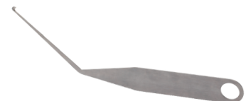
I) Retrograde Knife