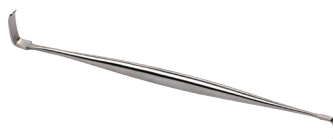
H) Ragnell Retractor