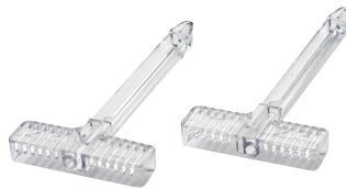
B) Right/Left Guides